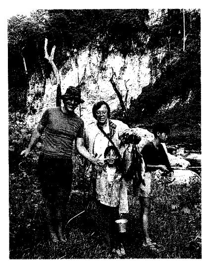
Not many got away.

e, our wives and my daughter packed our fishing gear and set off for the Sri Nakarin reservoir. This mighty, artificial lake has been formed by one of those many controversial dam projects which conscientious citizens today are trying to prevent from being built. Their environmental impact have been devastating and their value as energy producing ventures has been questioned — but they are no doubt full of fish, as we soon were to discover.