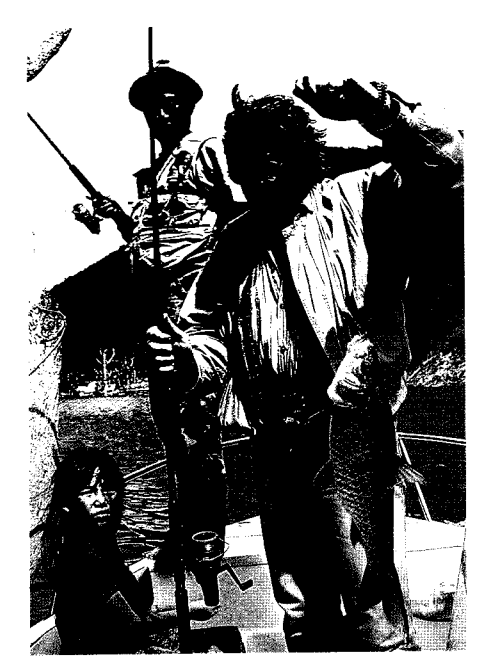
FCCT Presidentissimo tempts wrath of fish rights activists

One of the few ways of being bitten by a snake is to accidentally step on one — (which I have done, without being bitten) — or if you stumble upon a lady cobra with eggs, and she thinks you are going to steal them. Like any caring mother, she will defend her offsprings. Then, of course, there are uncivilised snakes as well, such as the Malayan pit viper (which doesn't go away when he takes up the scent of human beings) and the green pit viper (which likes to hang out in trees and may fall on you).