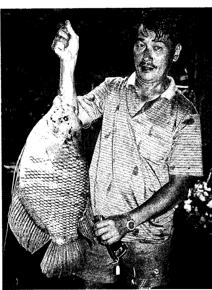
Sutee and Gourami (the fishy).